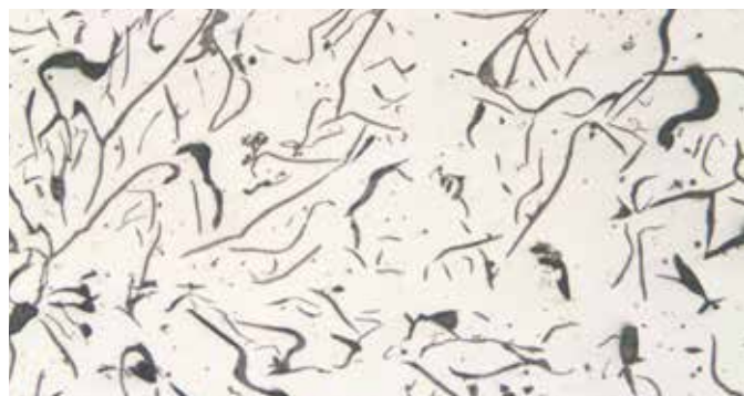
Materials Science example image: cast iron

The Olympus LC30 color camera for microscopy combines versatility with performance. With up to 37 frames per second (fps), faithful color reproduction, full integration into Olympus imaging platforms, and an excellent cost-performance ratio, the LC30 is the ideal entry-level microscope camera for quality bright-field imaging — suitable for applications in life and material sciences. The sensitivity and frame rate of the 3.1-megapixel CMOS chip can be increased using various binning modes, resulting in easy observation and focusing. The LC30 camera can be quickly and easily mounted on all microscopes equipped with a standard C-mount adaptor, and requires only a single USB 2.0 cable for high-speed data transfer and power supply. Its complete integration into the cellSens and OLYMPUS Stream imaging platforms helps ensure the seamless interaction of microscope, camera, and additional devices, delivering intuitive and efficient operation.