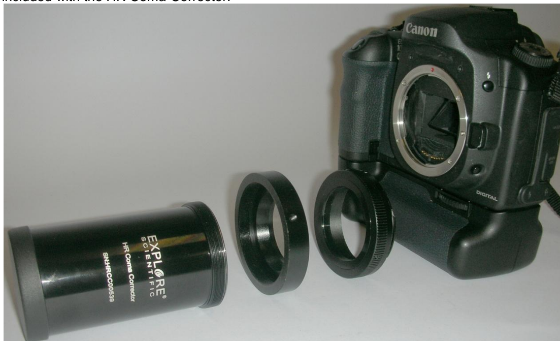
Figure 5: HR Coma Corrector with T2-Adaptor, T2-Ring and camera

For Astrophotography the helical focuser of the HR Coma Correctors has to be removed. Remove the small radial Allen screw so that you are able to unscrew the helical focuser from the corrector body (See figure 2). You can attach the camera via two adaptors that come with your HR Coma Corrector: one adaptor with T2-thread, that you can use together with different camera bodies, like DSLRs. Please notice that you need an additional T2-ring for your specific camera model. This T2-ring is not included with the HR Coma-Corrector.