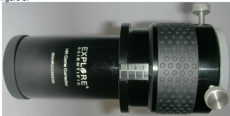
Figure 3 Zero Position

Let us configure the HR Coma Corrector first. At the side of the HR Coma Corrector you will notice a groove that contains a laser-etched scale. It shows you marks in 1mm divisions – 4 to one side and the 5 th to the other side for better overview. Screw the top end of the helical focuser out, until the rim of the movable part is 13,5mm above the lower end of the helical, as shown in figure 3.