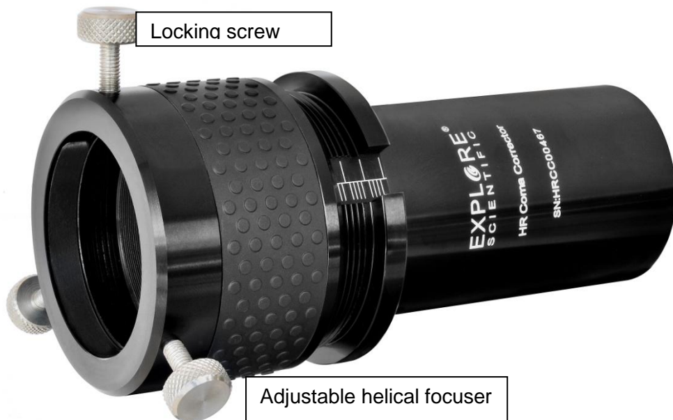
Figure 1: Front view

Congratulations on the purchase of the Explore Scientific HR Coma Correctors. You can use the HR Coma Corrector visually and photographically. When you receive the HR Coma Corrector, it is assembled for visual work. Two big parts are connected for this purpose – the base unit that includes the optical system of the HR Coma Corrector and the attached helical focuser. A small radial Allen screw secures the helical focuser. This Allen screw can be removed by using a 2mm Allen key (not part of the delivery).