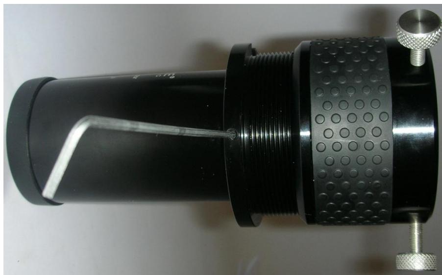
Figure 2: Back view with 2mm Allen key for the locking screw