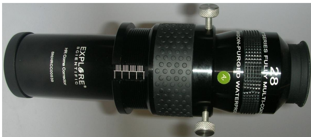
Figure 4: HR Coma Corrector with eyepiece that has a field stop 3mm below reference

Now remove the tape and insert an eyepiece into the corrector and secure it with the locking screws. Focus the eyepiece with the helical focuser by rotating the eyepiece - without touching the telescopes focuser. If you know the internal position of the field stop of your eyepiece, you can rotate directly until the correct value appears on the scale. If you – for example – know that the field stop is located 3mm below the reference surface (upper end of the eyepiece barrel), screw the helical to 13,5+3=16,5 mm and then do the fine focusing.