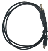
Video output cable (x1)