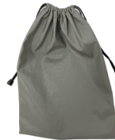
Carry bag (x1)