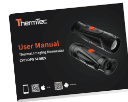
User manual (x1)