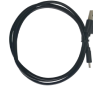
USB cable (x1)